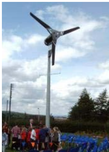
Figure 2: Small scale wind turbine at a primary school in Telford

Finally a recent report by the Sustainable Development Commission " Seeing the Light " 3 (October 2005) illustrated how on-site energy generation has the remarkable effect of increasing on-site energy efficiency and reducing energy demand within homes and schools by raising awareness of energy consumption. Installation of small-scale renewables thus effectively 'kills two birds with one stone', reducing demand for electricity by encouraging energy efficiency, as well as contributing towards renewable generation targets. This valuable consequence should serve to provide a further driver and encouragement for the implementation of small-scale wind energy within Greater London area and its surrounds.