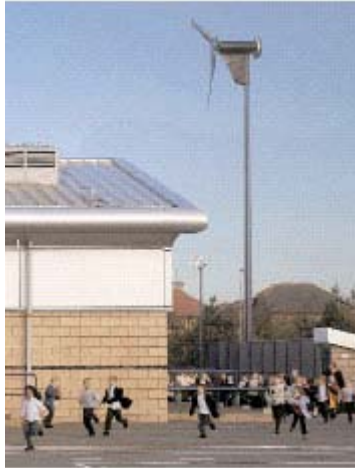
Figure 3: Small scale wind turbine at a Primary School in Lanarkshire 4

One factor to bear in mind is that the viability of the smaller schemes is often heavily cost reliant. Ideally, each site should therefore be matched to extract maximum generation from the available wind resource but at minimal cost. Grants from the DTI are available to help with the installation of small turbines (see Section 4.4 Stage 7), however, projects of this nature might also be appropriate for joint initiatives with large retailers, utilities, land owners or developers who would help to spread the costs.